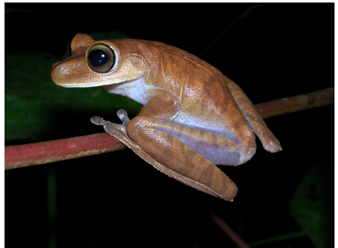
FIGURE 1. Adult live male of Bokermannohyla lucianae from Fazenda Santa Clara, municipality of Canavieiras, state of Bahia, Brazil.

The second population was found at the Private Reserve of Natural Heritage (RPPN) Serra Bonita (15°23'37.5" S, 39°33'58.1" W, 816 m above sea level), municipality of Camacan, Bahia. A male B. lucianae (MZUESC 8295) was collected at 21:30 h on 27 March 2010 when calling from a bromeliad 5.0 meters above the ground, next to an intermittent stream. Four other individuals of B. lucianae were heard at the same locality, all of them calling from bromeliads between 5.0 and 10.0 m height. A second expedition to the same stream resulted in the collection of two other specimens (MZUESC 8296-8297) on 8 May 2010 at 21:00 h. Both were located in a shrub between 50 and 70 cm above the ground. A survey of the amphibians of the RPPN has been underway since February 2009, consisting of visual and acoustic sampling at 36 sites. So far B.